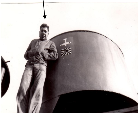
Flying bridge lookout

WWII Service: I joined the Coast Guard at age 17 and served in the Phillipine Islands on a Coast Guard-manned Army ammunition ship (FS-203) which served the infantry. Our ship happened to lodge on some coral, its nose went up, and we were stranded for over 2 days. One very dark night, my captain spotted movement on land and ordered me to fire a round from one of the carbine rifles in the direction of the movement. I did and the Japanese returned fire. They had about 11-12 outrigger canoes, each carrying 7-8 men. We exchanged fire with them from the carbines and our anti-aircraft guns. Several opposing forces didn’t make it, the rest retreated, but we didn’t lose one man. Thankfully, our ship got dislodged from the coral. My second ship was the USS Murzim (an AK-95, Crater-class cargo ship), and we delivered troops, goods and equipment to locations in the Asiatic Pacific Theater. (cont’d. on p. 4)