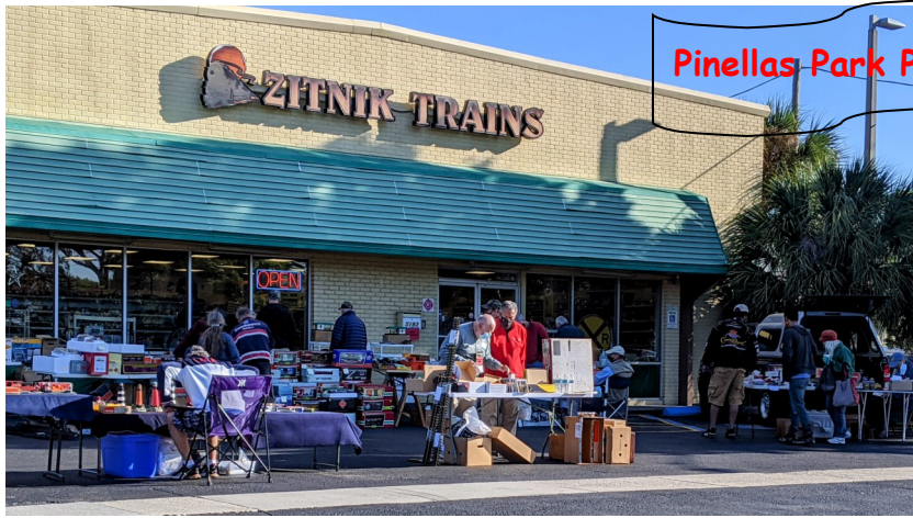
Pinellas Park Photos