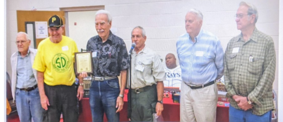
Above: Our Newest Tinplate Tycoon Poses with Southern Division Tinplate Tycoons