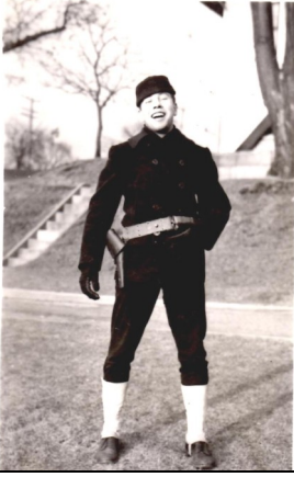
Something struck me funny on a routine patrol.

WWII (cont’d.) During the service, I also trained as a boxer but never pursued it after the war ended. I was a Signalman Petty Officer Third Class (SM3) and proudly served from Jan. ‘43-Mar. ‘46, with 22 of those months in combat.