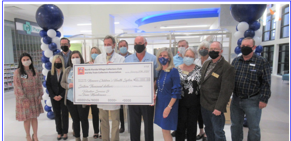
Above: TCA and NFVCC reps. donate $16,000 check to Nemours Children’s Specialty Care, Jax (story and additional photos on p. 3)