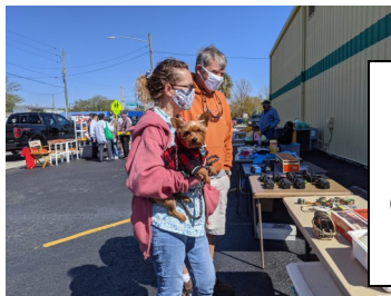
Left: the dog had fun but didn't buy anything.